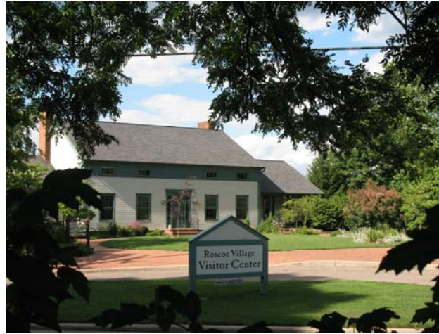
It all begins at the Visitor Center